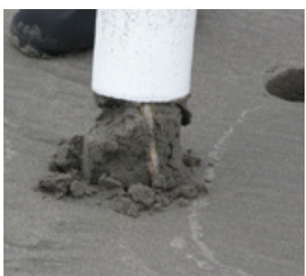
STEP FIVE: Collect your prize!