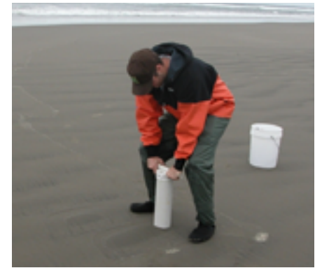
(continued on reverse side)

Place your thumb or finger over the air hole of the clam gun. Lift the column of sand slowly and with your legs. This can be fairly heavy and it's important that you use proper lifting technique.