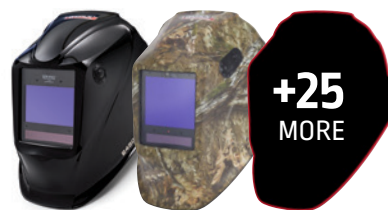
All VIKING™ 2450, 2450 ADV 3350 & 3350 ADV Series Welding Helmets