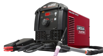
Square Wave® TIG 200 K5126-1