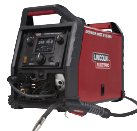
POWER MIG 215 MPI* K4876-1