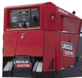
Ranger® 330MPX™ EFI K4779-1

**Qualifying Stack and Save products are Lincoln Electric accessories and filler metals. Excludes welders and plasma cutters. Stack & Save offer only available with purchase of rebated machines. Only one Stack & Save rebate per receipt/invoice. Qualifying purchases must be made at Lincoln Electric authorized U.S. Distributors only. Rebate offers effective February 5 - June 30, 2024. Offers available only to end users, while supplies last, and may be discontinued at any time. Price is based on current MSRP, which is subject to change. Total price to end user determined by actual sales price. Purchase may be subject to additional taxes and fees. Available at Lincoln Electric Authorized U.S. Distributors only. Contact a Lincoln Electric representative for current promotion status. Rebate claim forms must be submitted within 30 days of purchase by end user.