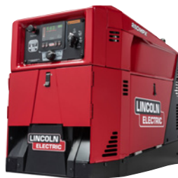
Ranger 260MPX K3458-1