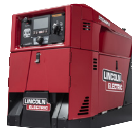
Ranger 330MPX K3459-1