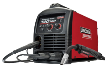
POWER MIG 140 MP** K4498-1