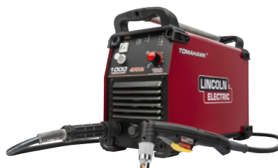
Tomahawk® 1000 K2808-1